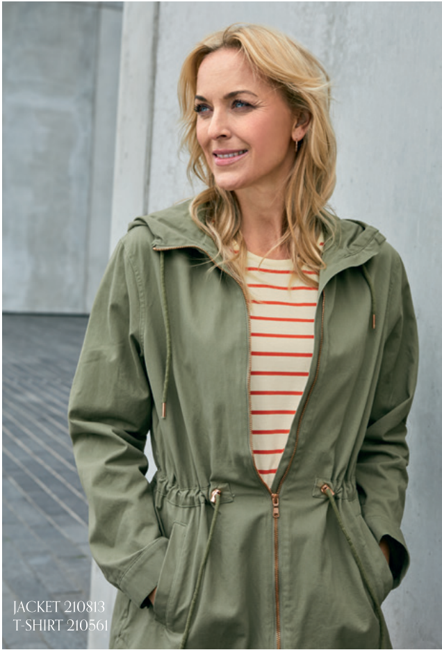
JACKET 210813 T-SHIRT 210561