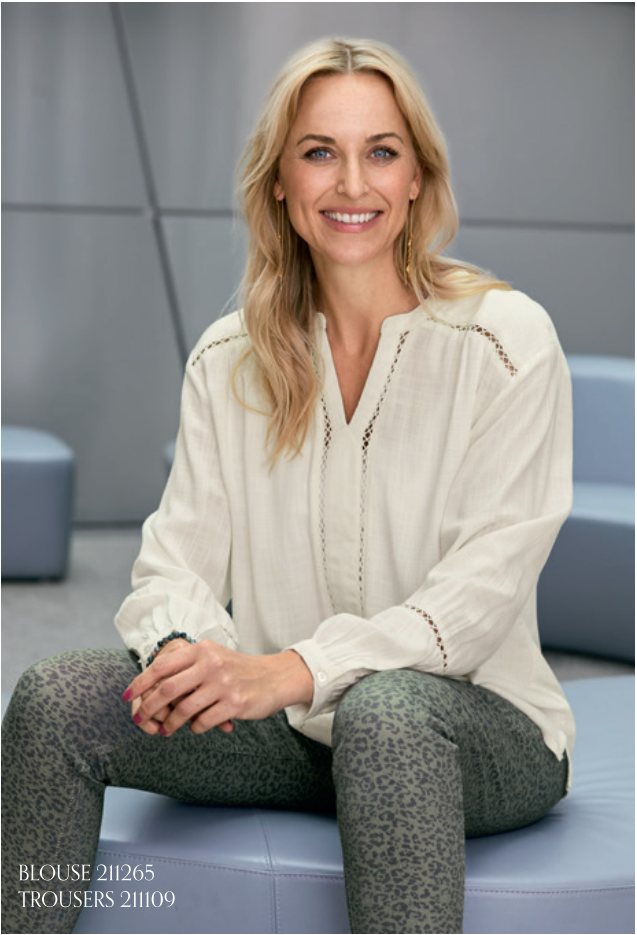
BLOUSE 211265 TROUSERS 211109