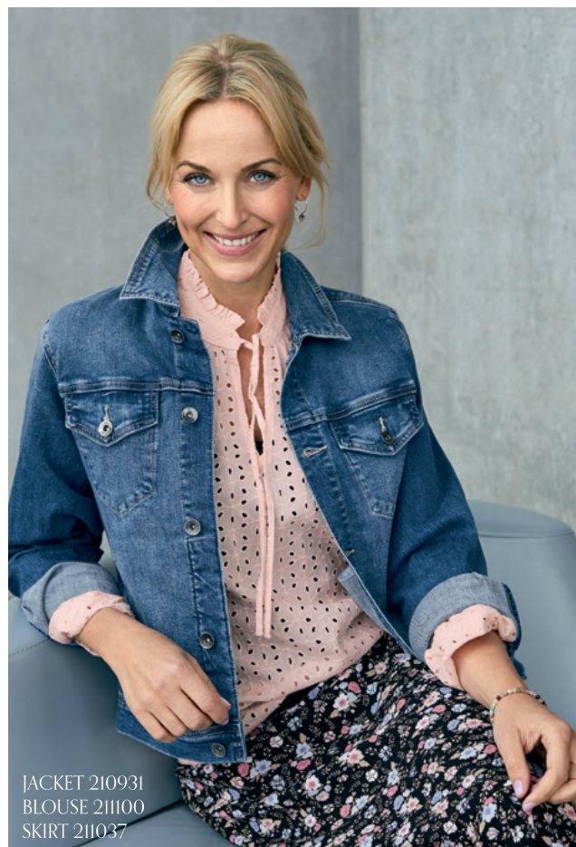
JACKET 210931 BLOUSE 211100 SKIRT 211037