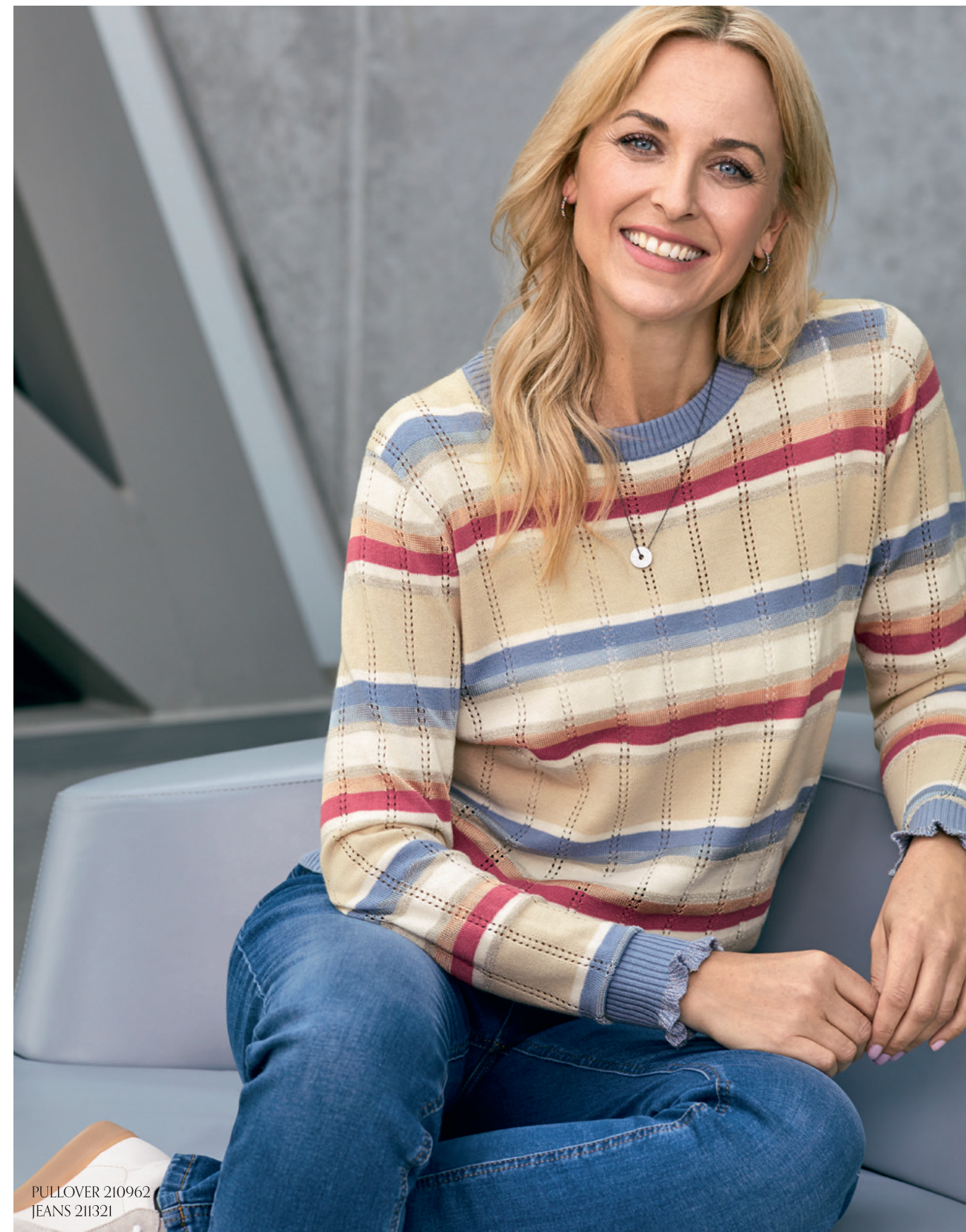
PULLOVER 210962 JEANS 211321