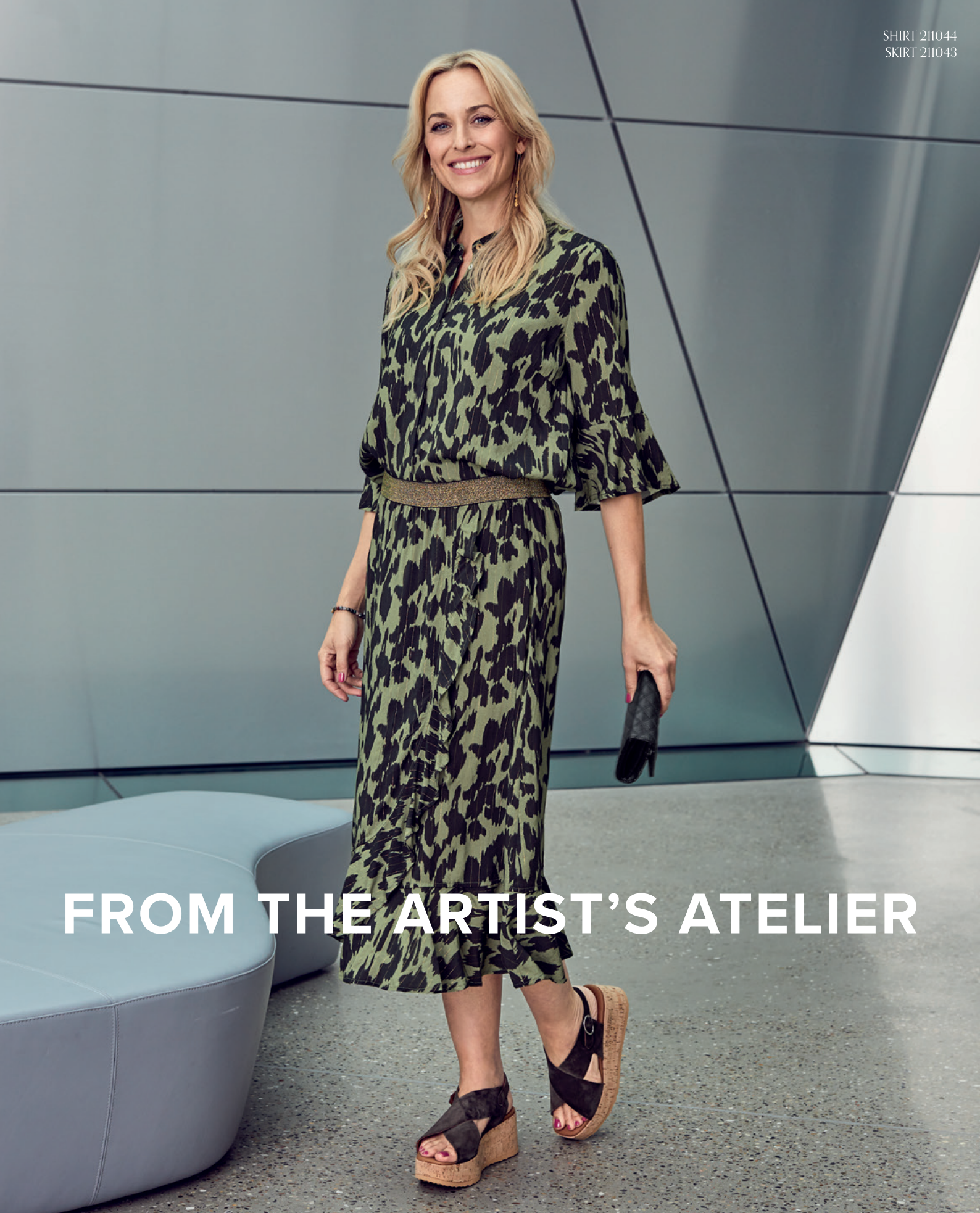
SHIRT 211044 SKIRT 211043