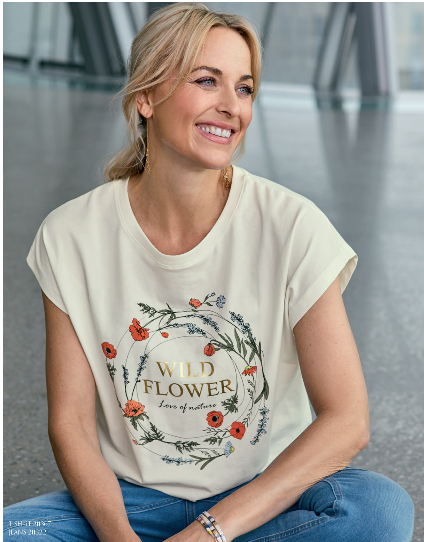
T-SHIRT 211367 JEANS 211322