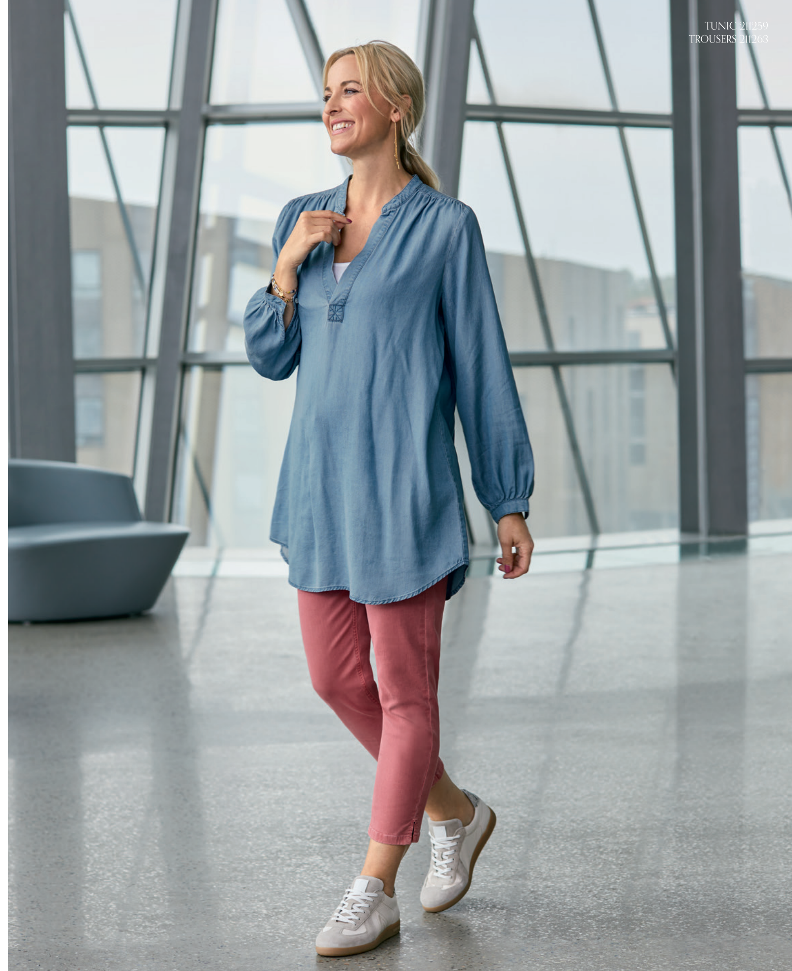
TUNIC 211259 TROUSERS 211263