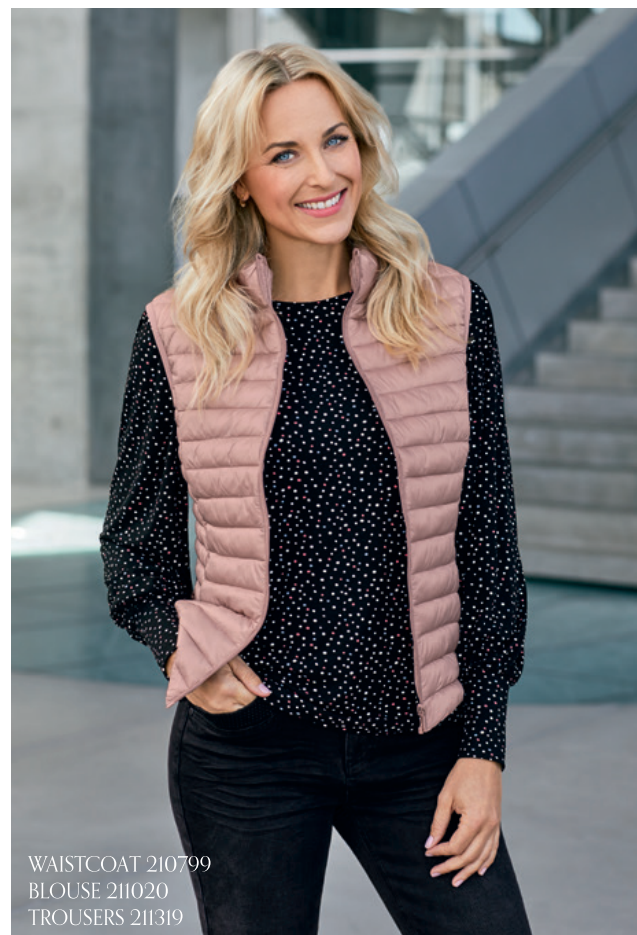
WAISTCOAT 210799 BLOUSE 211020 TROUSERS 211319