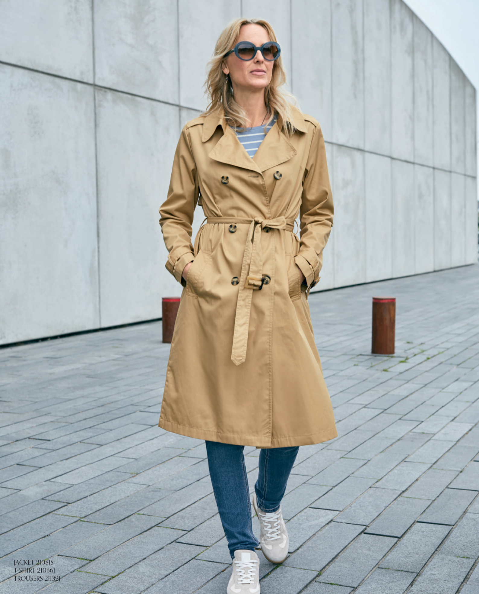
JACKET 210818 T-SHIRT 210561 TROUSERS 211321