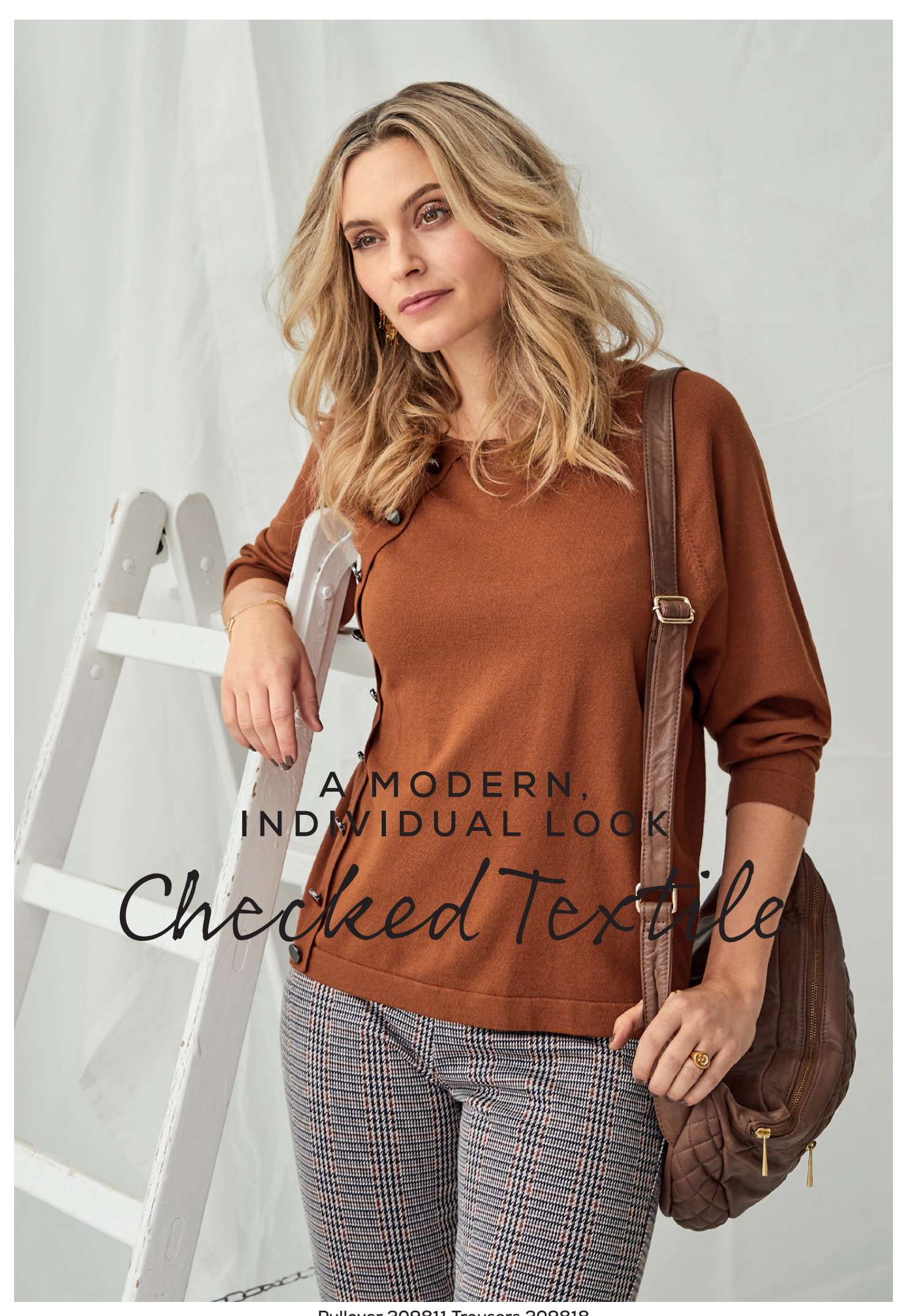
Pullover 209811 Trousers 209818