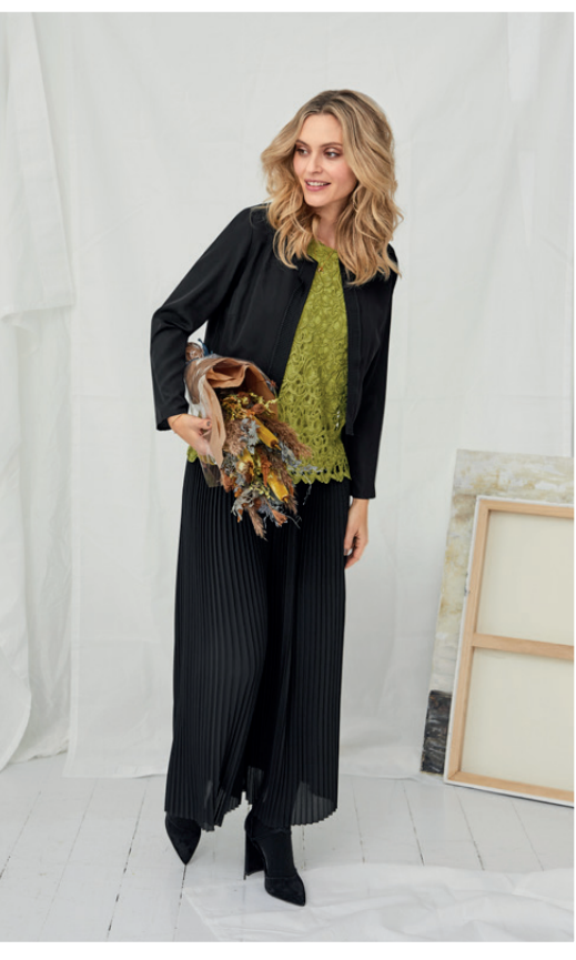
Our new flower print with silver details is a unique look for this season. Explore our collection to find attractive looks for any occasion.