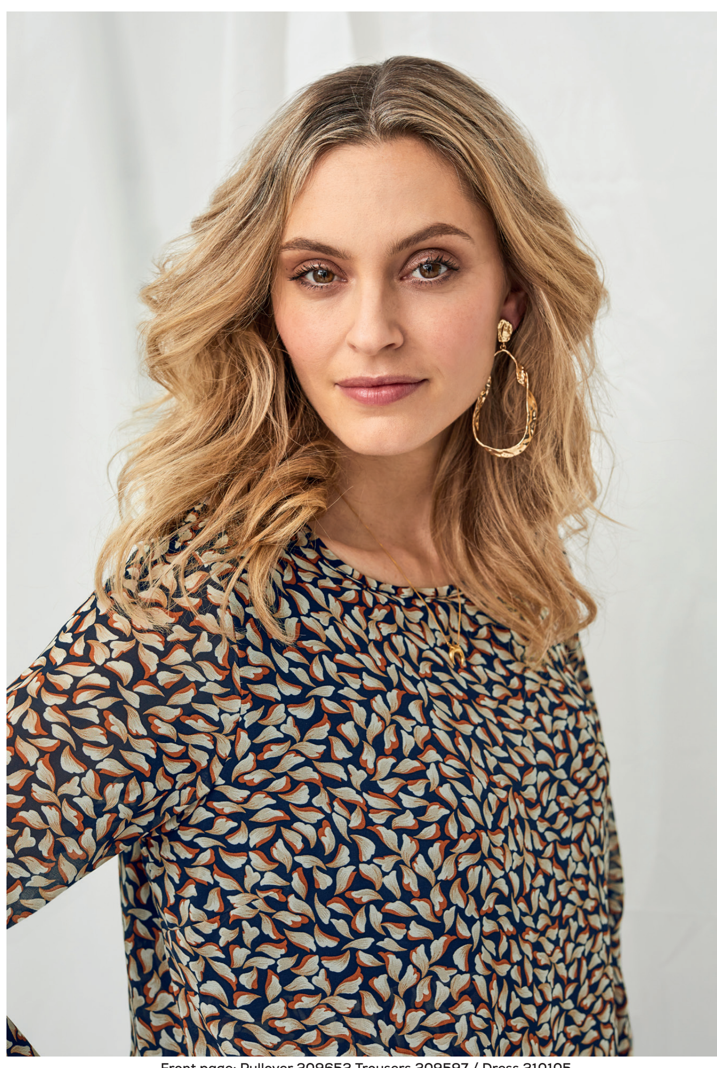
Front page: Pullover 209652 Trousers 209597 / Dress 210105