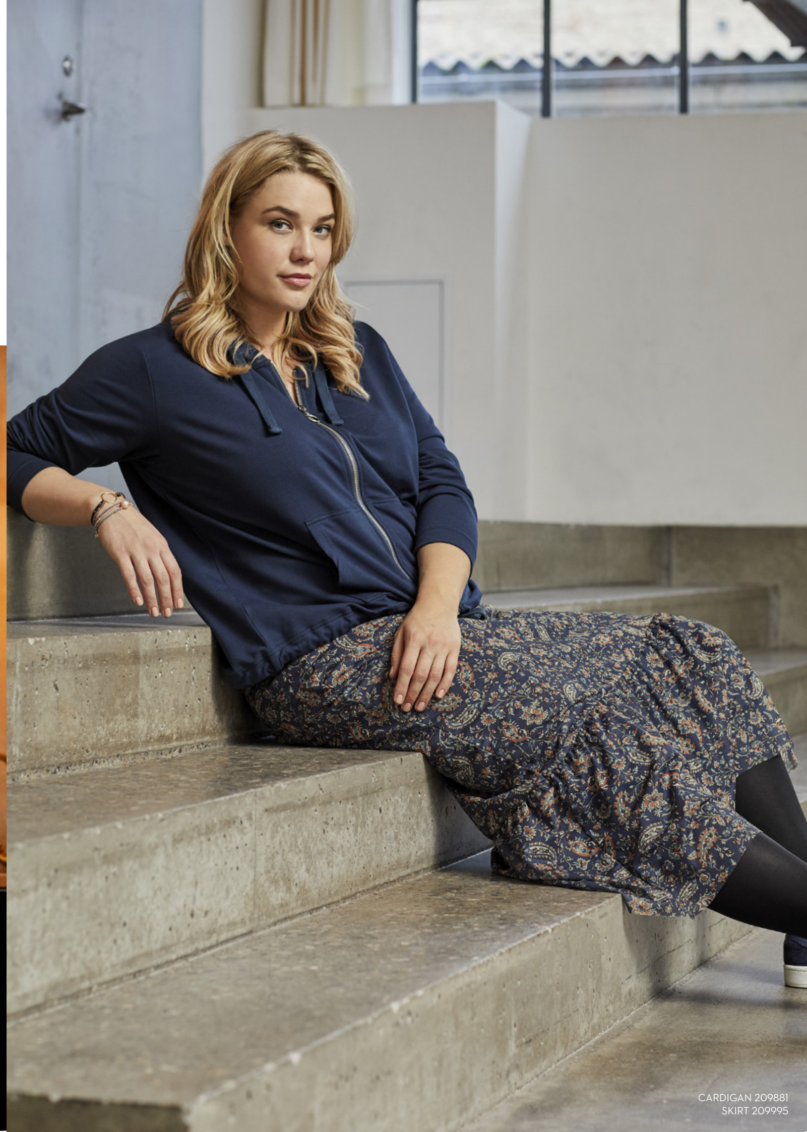
CARDIGAN 209881 SKIRT 209995