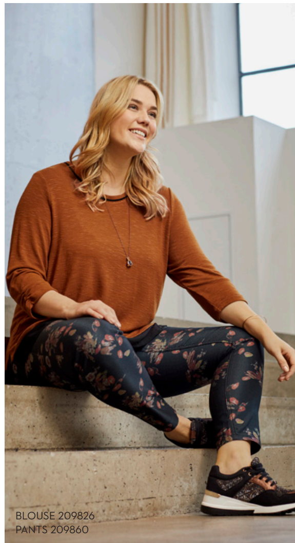
BLOUSE 209826 PANTS 209860

Blouses, tunics, leggings, and pants in lovely autumn colours. Mix bright with dark for a stylish result. This season's key item is our tight jeans with sporty stripe.