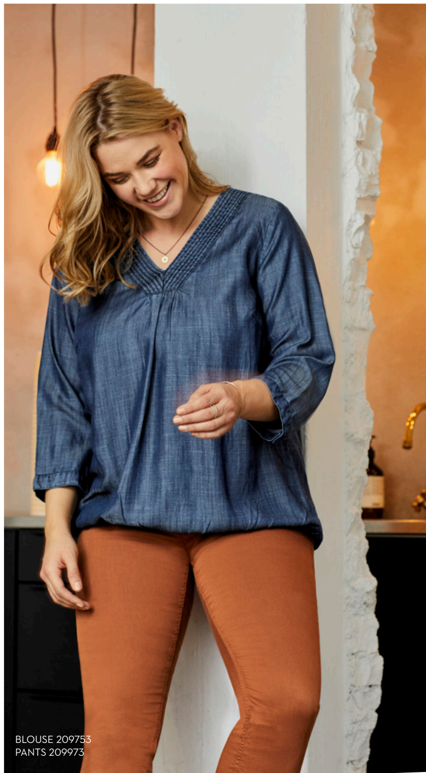
BLOUSE 209753 PANTS 209973

Don't feel blue. Wear it! Embrace the autumn days with tunics, dresses and denim in various nuances of blue and pretty paisley print. They look great with cognac colours for contrast.