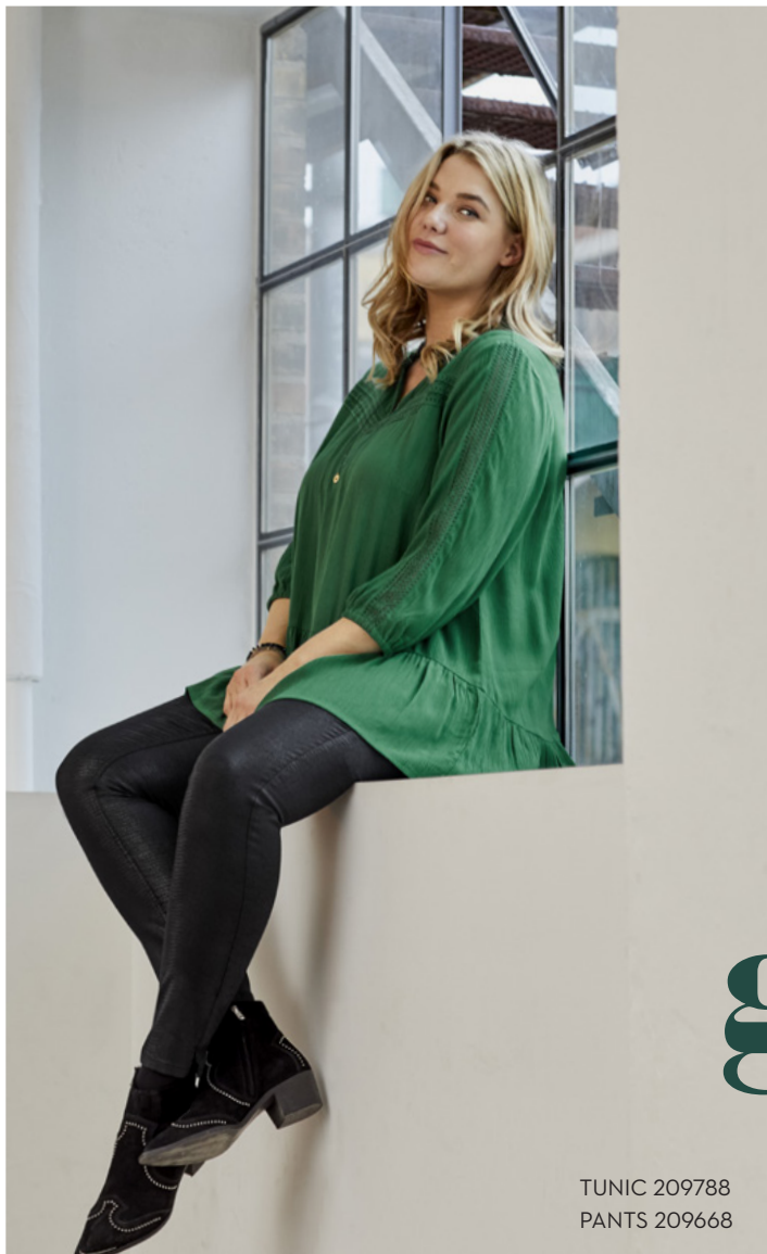
TUNIC 209788 PANTS 209668

Green is a key colour this season. Mix it up with grey or black for a trendy look. Also, check out our pinstripe cardigan and shirt with graphic pattern.