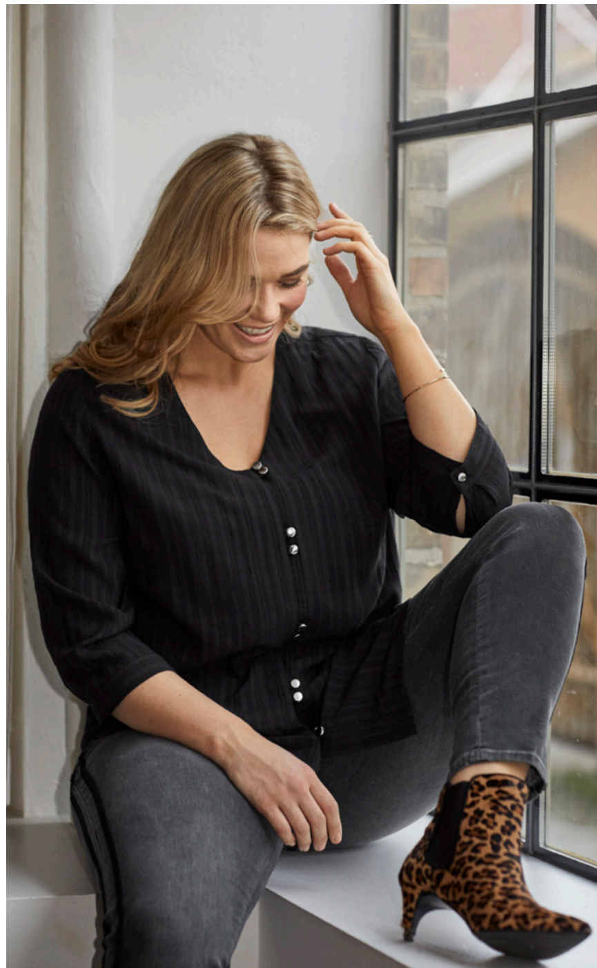
BLOUSE 210206 JEANS 210140

Blouses, tunics, leggings, and pants in lovely autumn colours. Mix bright with dark for a stylish result. This season's key item is our tight jeans with sporty stripe.