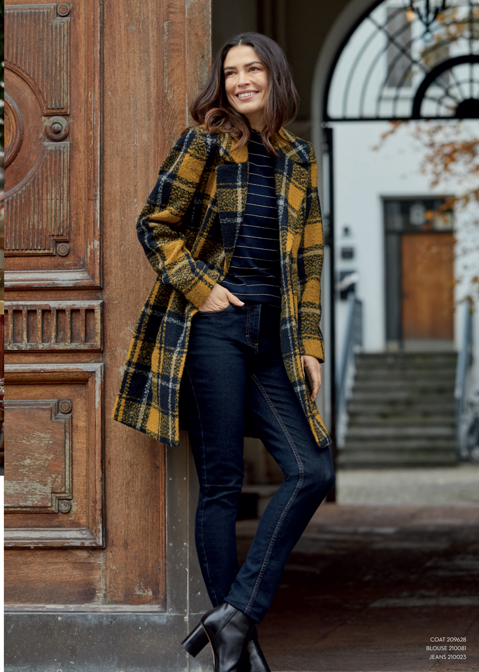
COAT 209628 BLOUSE 210081 JEANS 210023

Spoil yourself and go for a pretty and feminine look. The loose blouse with large stripe detail and the tartan jacket look stunning with cool, fitted denim.