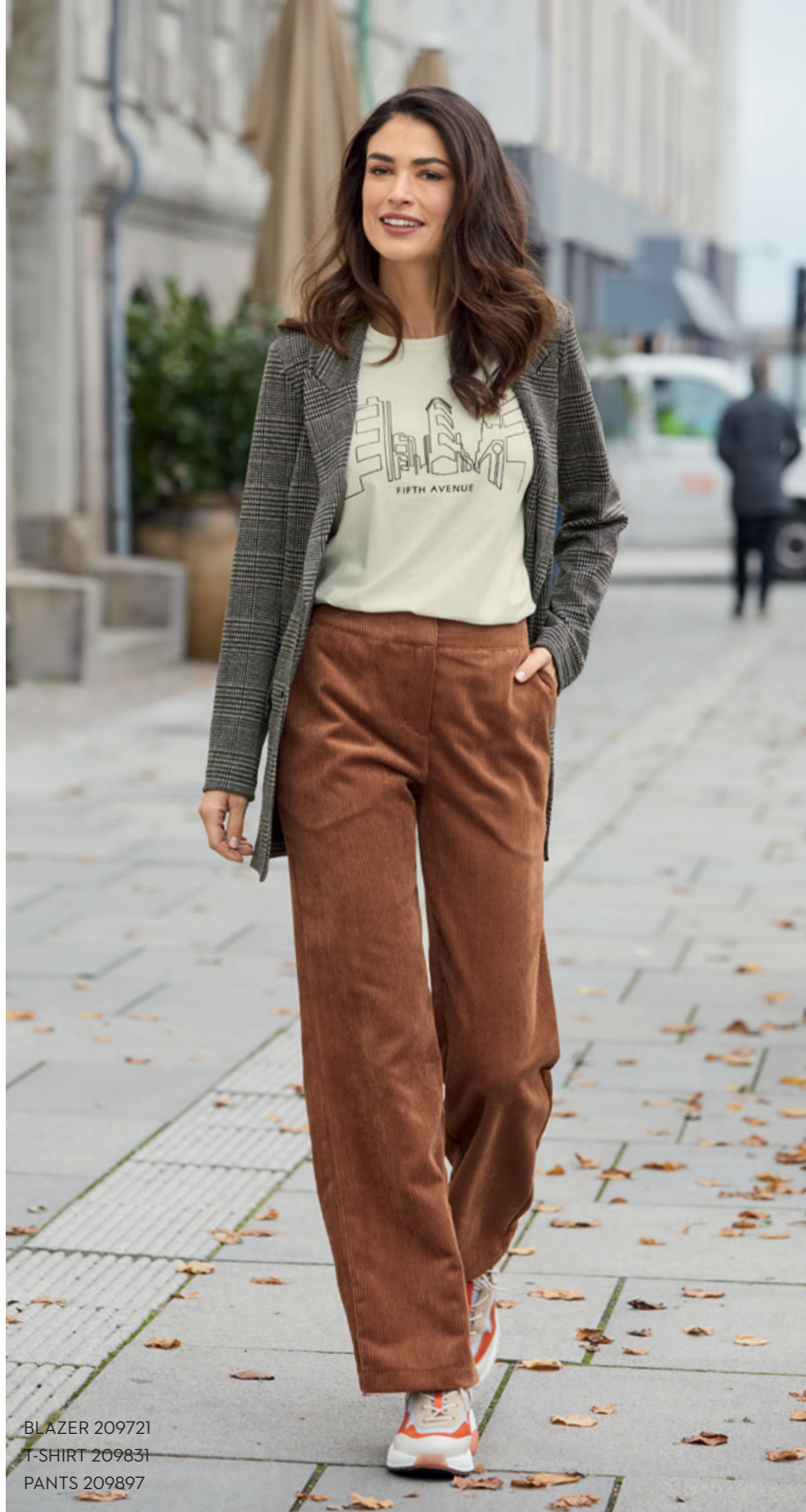
BLAZER 209721 T-SHIRT 209831 PANTS 209897