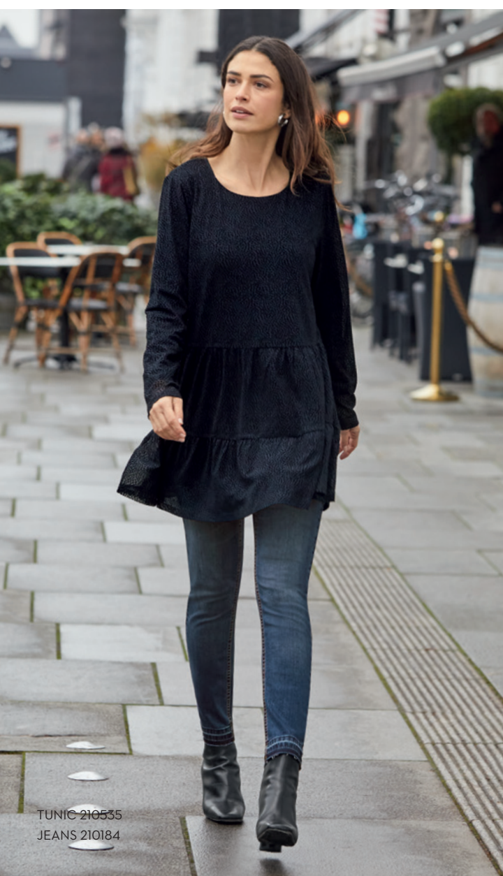
TUNIC 210535 JEANS 210184