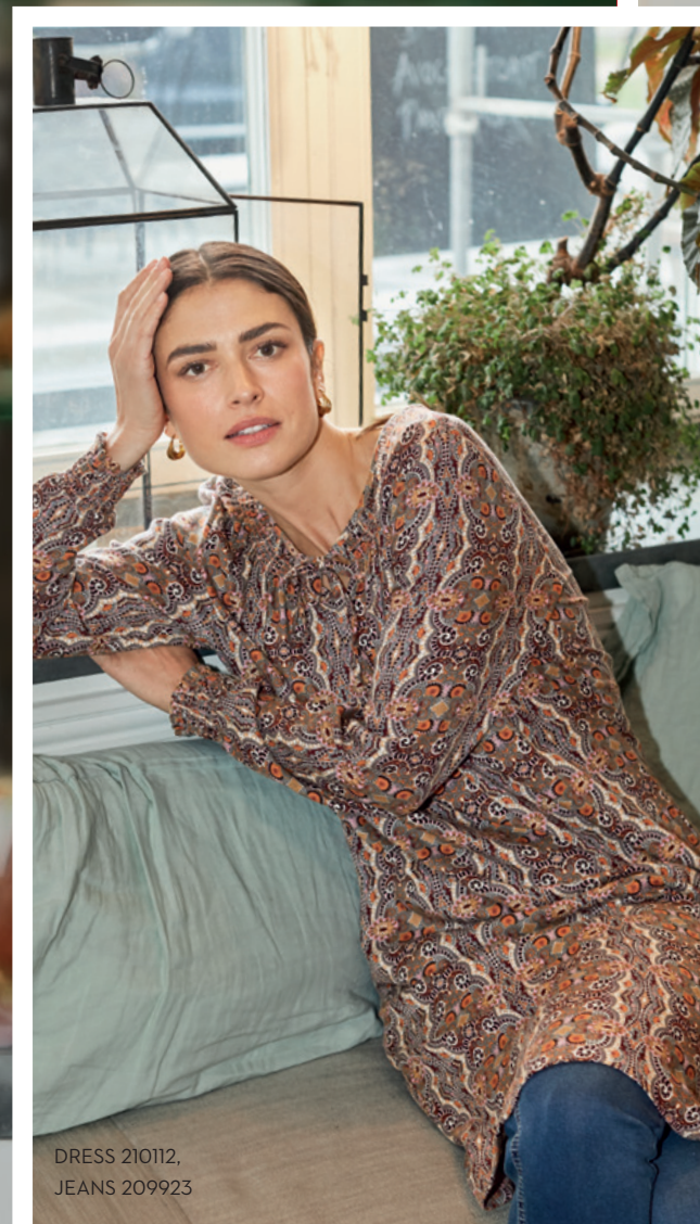
DRESS 210112, JEANS 209923