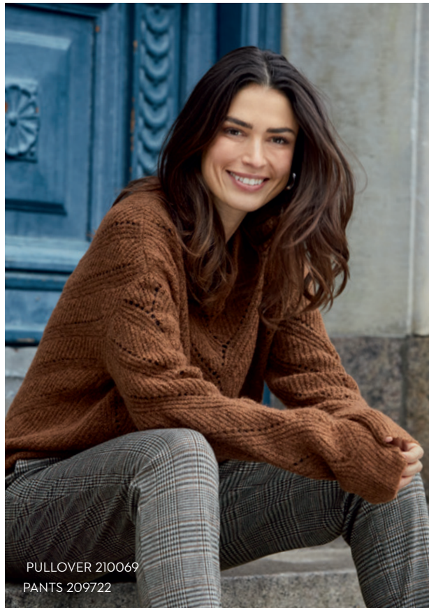
PULLOVER 210069 PANTS 209722