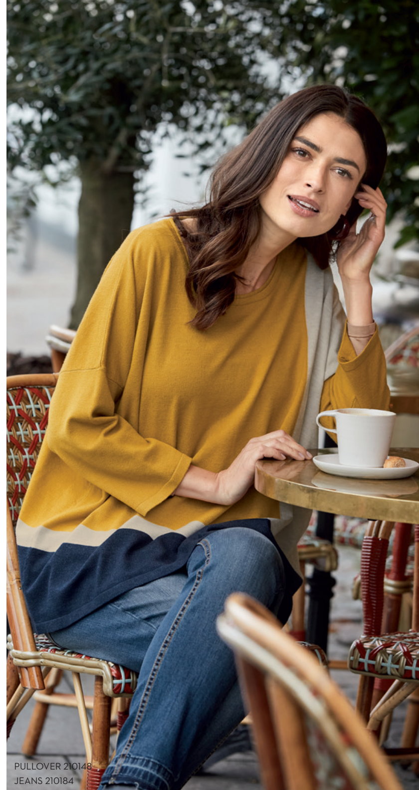
PULLOVER 210148 JEANS 210184