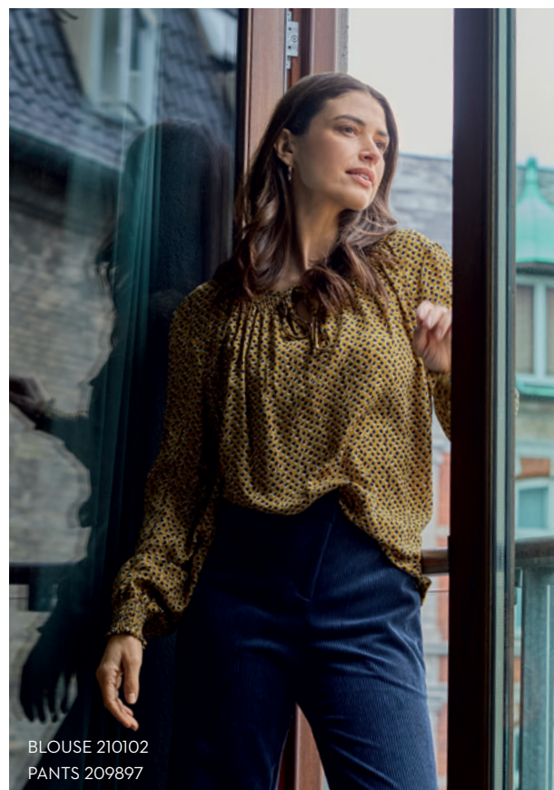
BLOUSE 210102 PANTS 209897