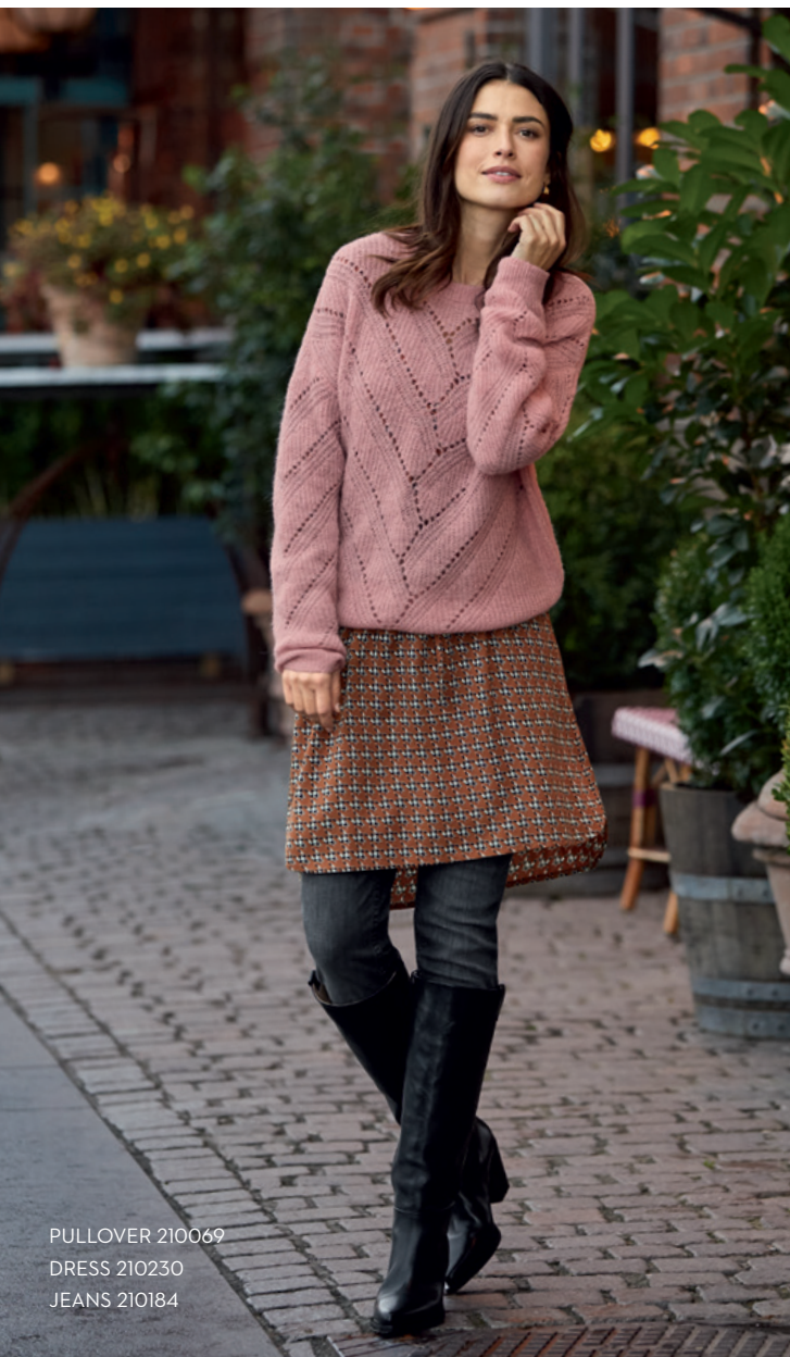
PULLOVER 210069 DRESS 210230 JEANS 210184