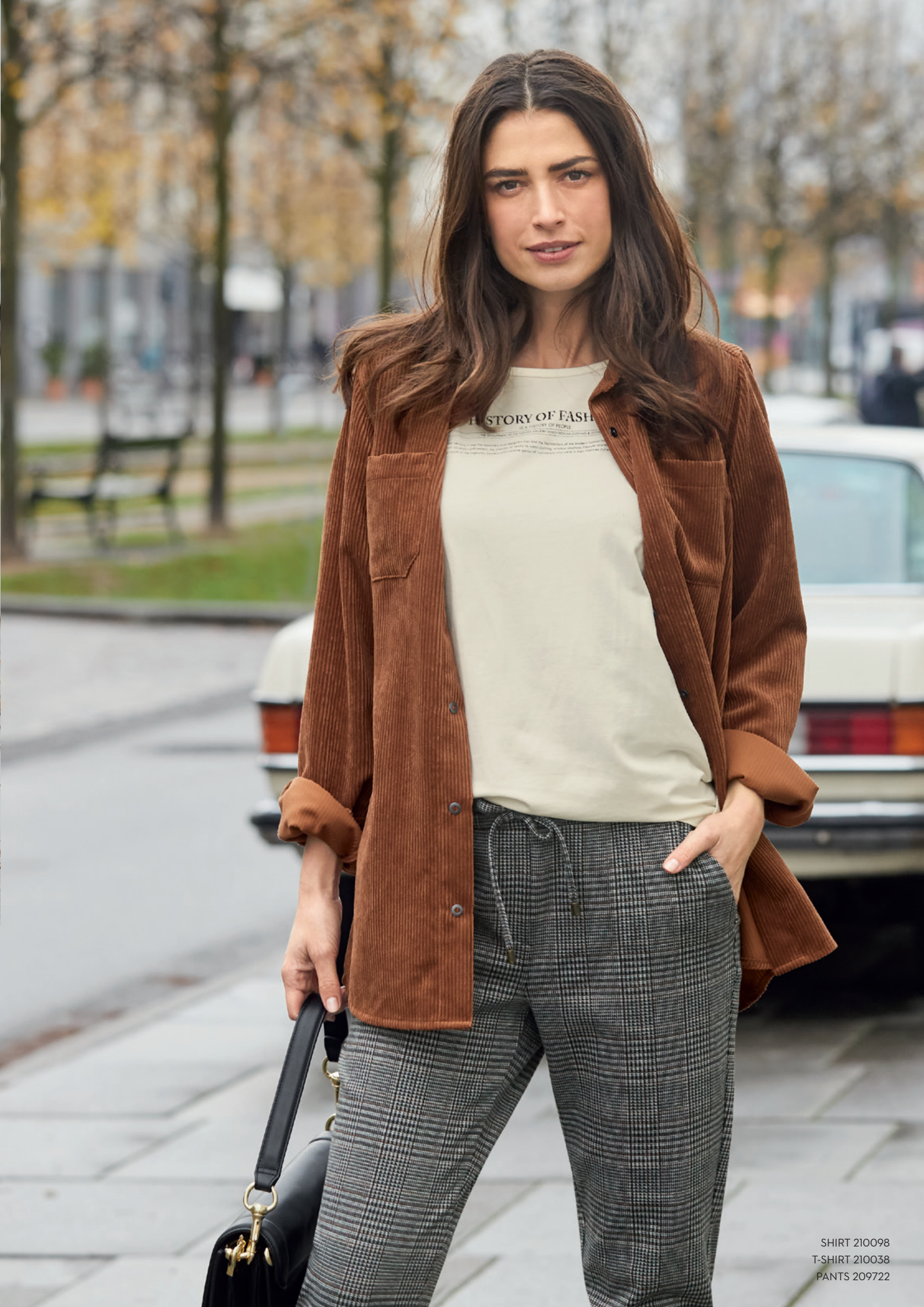
SHIRT 210098 T-SHIRT 210038 PANTS 209722

Style yourself and go for corduroy and check. Chunky sweaters, loose pants, and brownish and pink nuances will get you into that fun, retro groove.