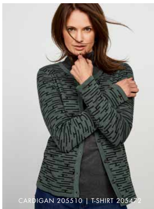
CARDIGAN 205510 | T-SHIRT 205472