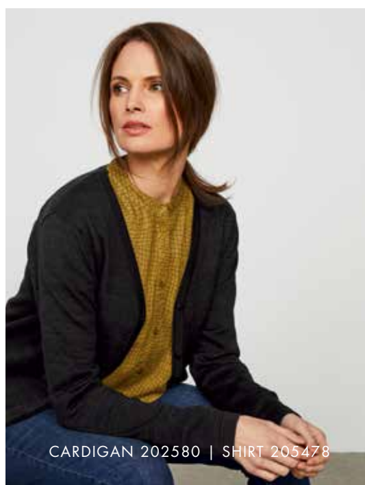
CARDIGAN 202580 | SHIRT 205478