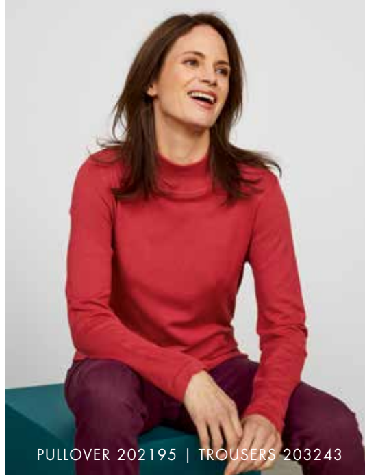
PULLOVER 202195 | TROUSERS 203243